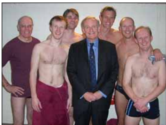
The full Paviors' team and Master

As usual, Paviors made a splash at the Inter-Livery Charity Swimathon in the pool at the RAC Club in Epsom.