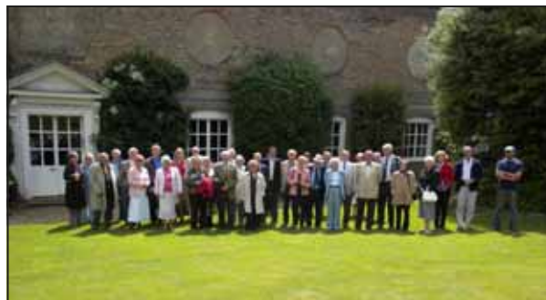
Luncheon Club Members at Stonor Park

A final cup of tea and some lengthy farewells brought a very successful day to its conclusion at about 4.30pm.