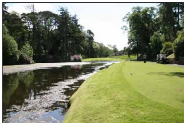
The Augusta of the North