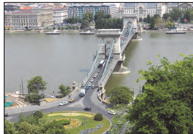
The Chain Bridge from the Funicular Railway Terminus