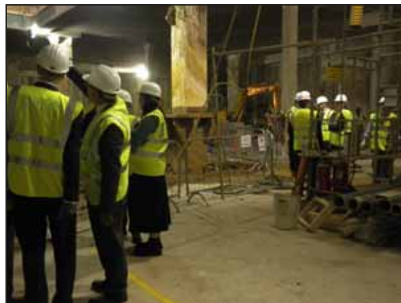
Inspecting the works on the third basement down