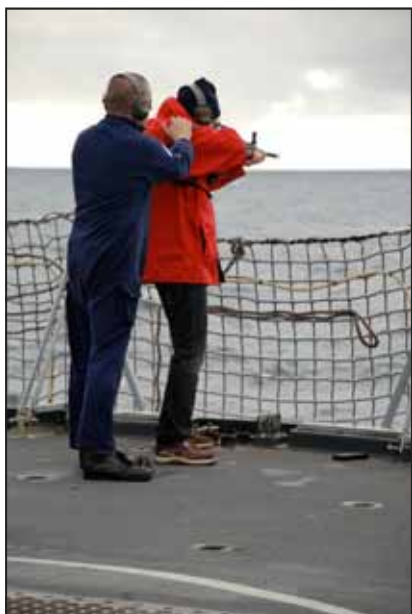
The Master takes aim with an SA80

Although our days were filled with lectures, demonstrations and tours of the various parts of the ship, in the evenings we were equally well looked after with dinner in the Senior Rates Mess or the Wardroom and on one evening the privilege of dining with the Captain who was an excellent and gracious host.