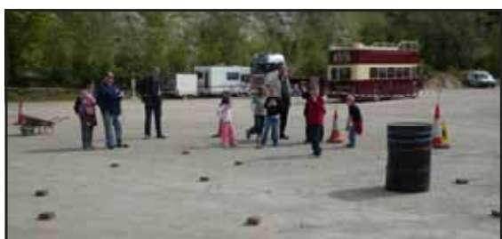
The drum and the completed spiral curve

This year marks the 50th Anniversary of the opening of the first UK Motorways and the Paviors Annual Fun Day at Amberley Working Museum reflected this by arranging motorway related celebrations in conjunction with the Institution of Highways and Transportation.