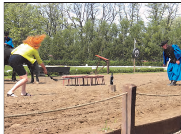
Cracking the whip