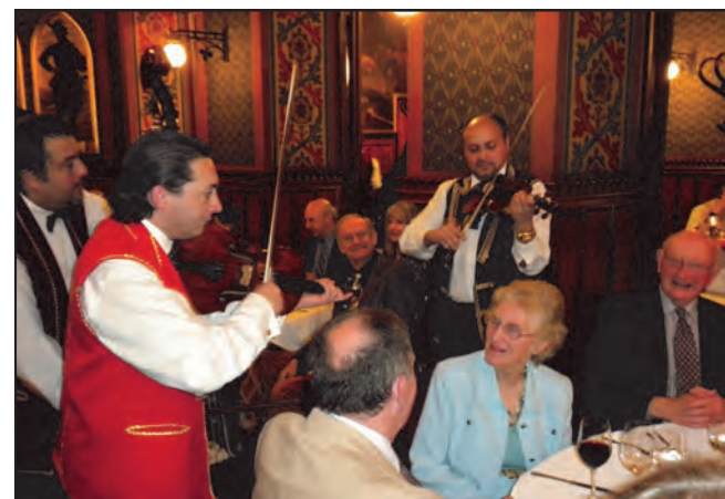
The Karpathia Restaurant Serenade