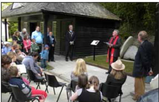
Dedication of Sculpture by IHT & Paviors