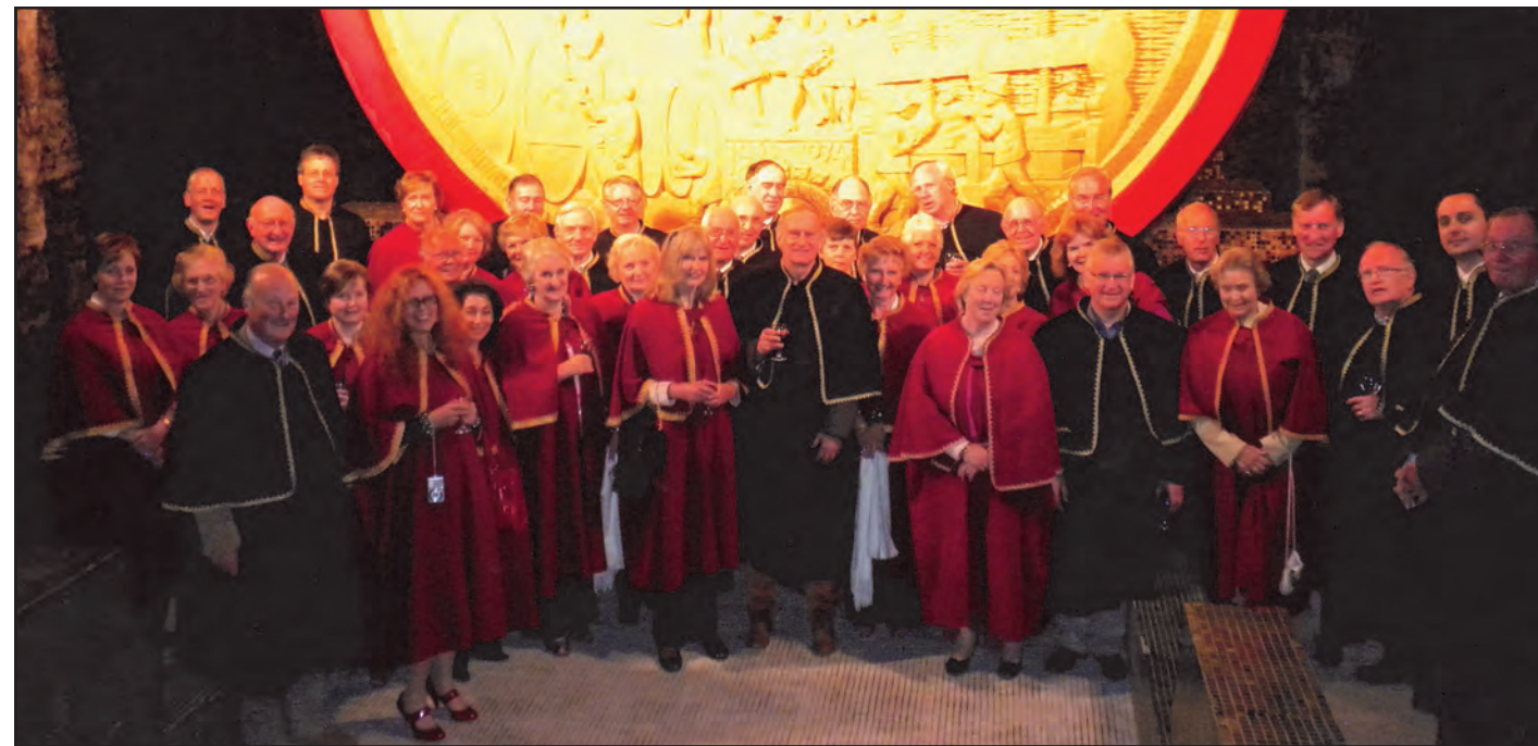
The Jolly Group sampling wine at the Budafok Cellars, in front of the largest Wine Barrel in the world

After a free afternoon, when most of the Jolly visited the Fishermen’s Bastion, the party set off for the Budafok cellars for a wine tasting. The cellars were formed from 120kms of tunnels created by mining the stone for the building of Budapest. We toured the cellars and tasted a number of wines including a magnificent Tokai wine. We also saw the largest barrel in the world which weighed 18 tonnes empty with a maximum diameter of 5.6 metres.