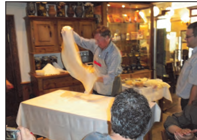
The Strudel Maker extraordinaire