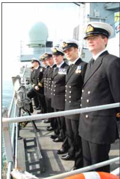
The Officers salute Devonport on their return

I think that I can speak for all of the Pavios who embarked on this trip, in saying that we were extremely well entertained and looked after wherever we were in the ship and the one outstanding thing we will all take