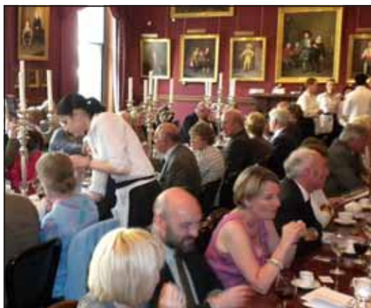
Paviors & Guests in the Garrick Club for a Reception and pre-Theatre Dinner

It was an early start for the Master's Summer Event at the Garrick Club, where seventy-six Paviors and their Guests enjoyed a reception and discourse on the history of the Garrick Club and its unique collection of Theatrical Art.