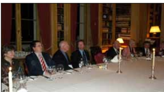
Paviors Wine Circle at Dinner in the Library, The Travellers Club