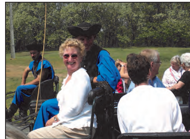
Having a wonderful time at the Lazar Equestrian Park