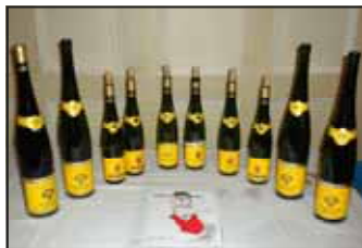
Selection of the fine Hugel wines for the tasting