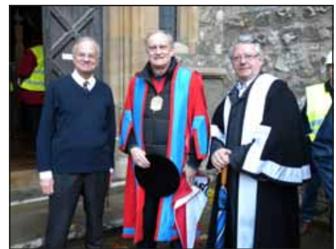
Master of Charterhouse sees our party off