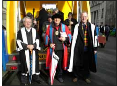
Company Dignitaries and St Anthony's Pig