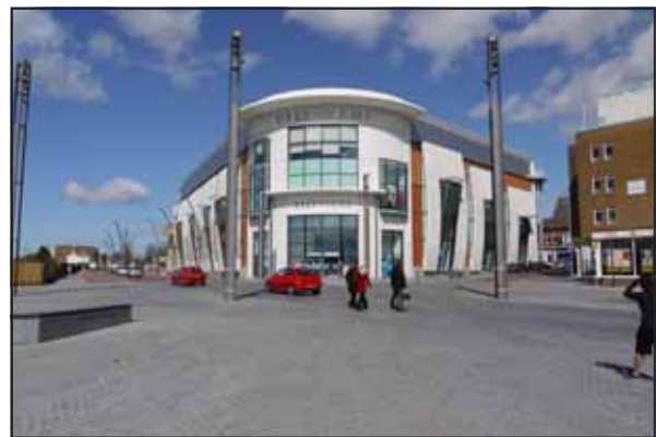
and After works completed