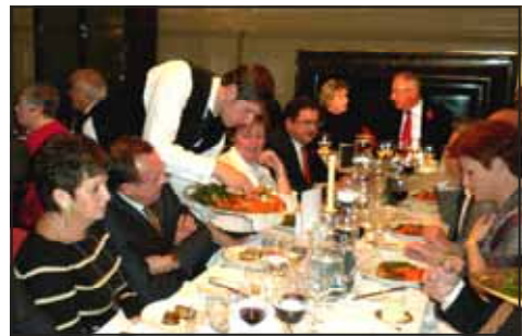
Dinner and conversations were excellent too!