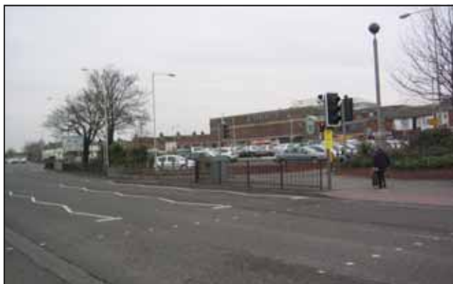
De-ringing of Ashford Ring Road—Before