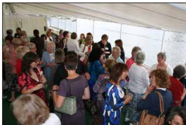
A Reception under canvas on the upper deck