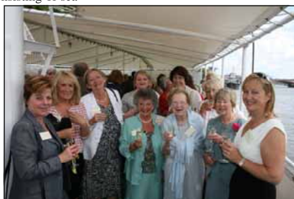
Ladies enjoying the Company