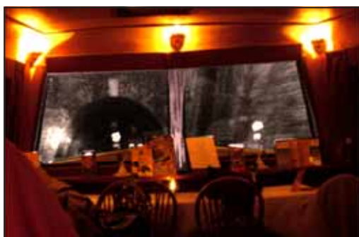
A VERY Close Fit indeed to our beam, but the Captain knew the way and we DID get through!