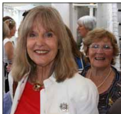
The Mistress Pavior's Welcome