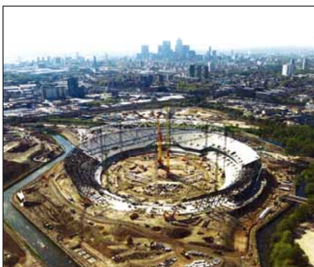
Main Stadium showing roof sections being lifted into place

The South Park Landscaping package covers a further 38 hectares and includes the preparation of all spectator support areas, soft landscaping including feature gardens, and the footpaths contained in the South Park boundary.