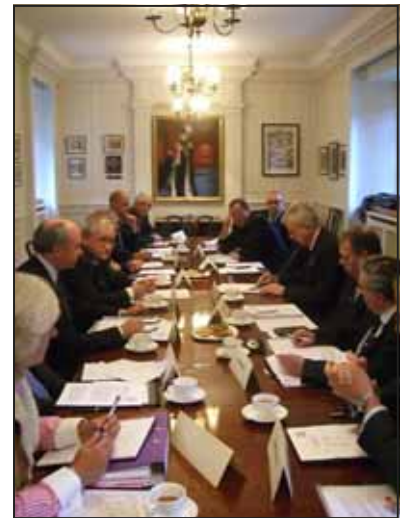
Meeting of Liverymen's Committee in Old Charterhouse on 5th November