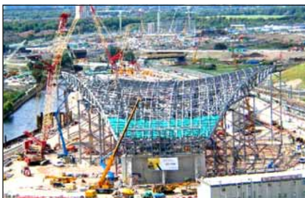
Aquatic Centre steel structure detailing the wave shape roof

The North Park Landscaping package covers an area of approximately 40 hectares and includes areas housing Eton Manor facilities, Velodrome, BMX, fencing, hockey and handball arenas. Works will include bulk earthworks, construction of main concourse, permanent soft landscaping, bioengineering of river edges and creation of wetland environments along with permanent park furniture and lighting.