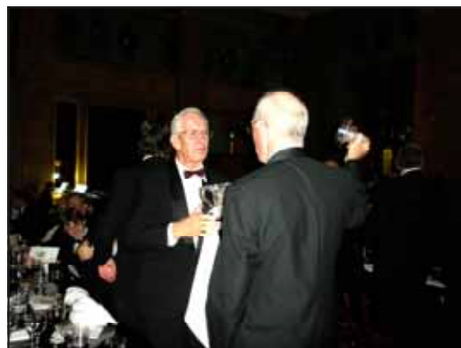
The Loving Cup with a flourish