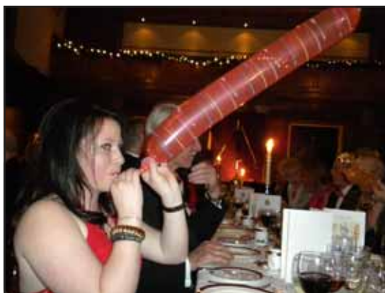
Enjoying the evening