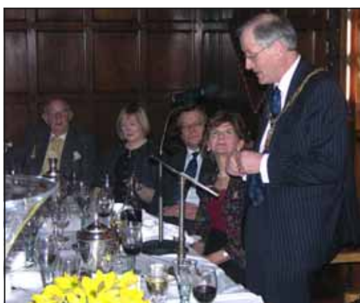
The Master responds with toast to Imm Past Master