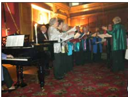
Voices in Accord in action