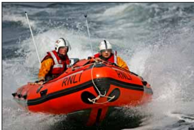
E Class Inshore Lifeboat - fastest lifeboat in the RNLI fleet, based at Tower Pier

Lifeboat crews are mostly volunteers, who come from all walks of life, and give up their time and comfort to carry out rescues and save lives at sea on the lifeboats. With over 4,800 lifeboat crew members in the United Kingdom and Republic of Ireland, of which over 340 are women, lifeboat crews are dedicated and make a major commitment – which could ultimately include risking their life.