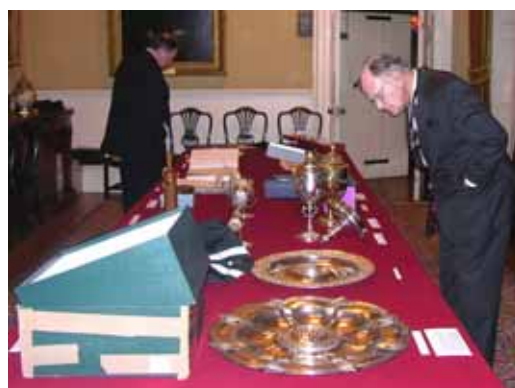
Viewing the Company's Plate and regalia on display in Armourers' Hall