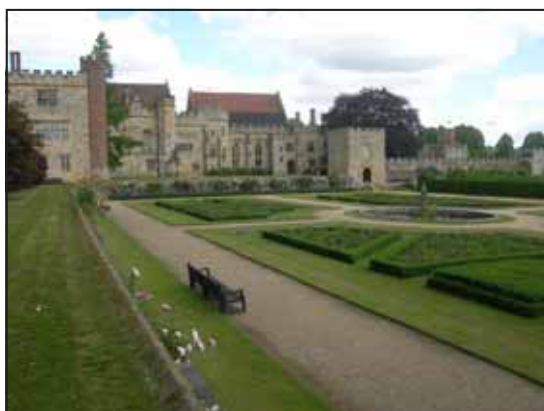
Hever Castle and Gardens, Near Edenbridge, Kent