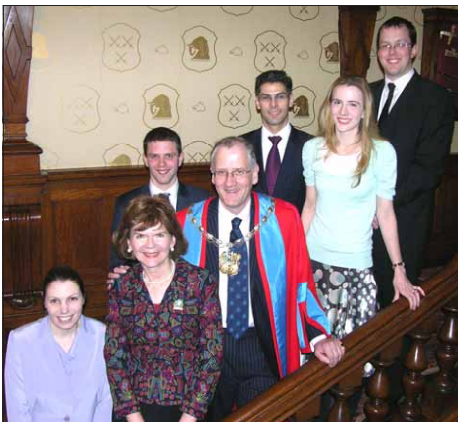
The Master & Mistress Pavior with family members in Cutlers' Hall

He joined Mowlem to work on the National Westminster Tower on the day of the first concrete pour for the raft of the Tower. He went on to design the slipforming methods for the core and then supervised the construction of the tower superstructure. During this time he became a Chartered Engineer. He subsequently wrote a paper for the Institution of Civil Engineers on the slipforming of the Tower for which he was awarded the Telford Medal.