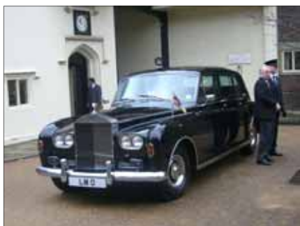
The Lord Mayor of London, Alderman and Pavior Michael Bear, and the Lady Mayoress arrive at the Charterhouse for the official opening of Paviors' House on 14 January