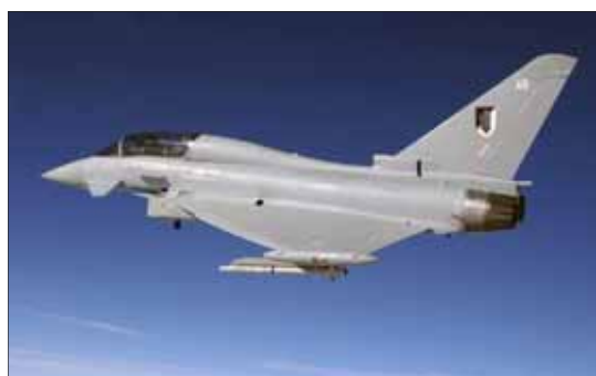
Typhoon as based at RAF Coningsby

Master Tom Barton visited Pavors' affiliate 29(R) Squadron at RAF Coningsby in early February. The Master arrived in mid-afternoon after normal flying had been completed for the day. However, he was extremely lucky to see a Spitfire from the Battle of Britain Flight take off for a test flight, which was quite a sight. Interestingly, from an engineering perspective, the Spitfire does not use the concrete pavements, but uses an adjacent grass strip which is more sympathetic to the suspension. The Master made the following presentations.