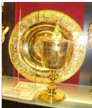
The Fire Cup