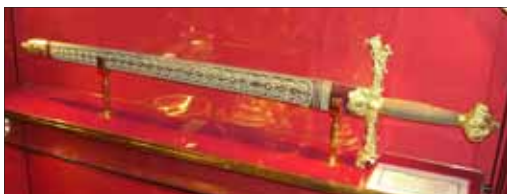
The Lord Mayor's Sword of Office

Following the guided tour, we assembled in the Drawing Room for a glass of champagne, and then moved to the Salon for lunch. As always at the Mansion House, this was delicious, and the meal was enhanced with much chatter and warm friendship that always make this occasion so special.