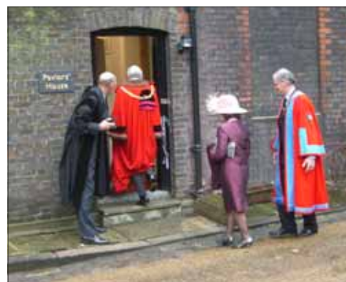
The ribbon is cut, then the Lord Mayor and Lady Mayoress enter Paviors' House in the company of the Learned Clerk and the Master