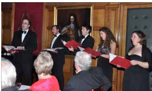
The City Blues Singers, from the Guildhall School of Music and Drama, brought some decorum to the evening; not only did they lead the singing, but also explained some of the background to the traditional carols