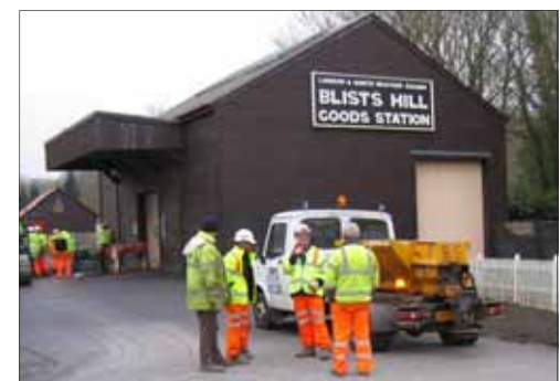
Finishing-off to create authenticity