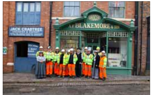
Ironbridge Gorge Museum