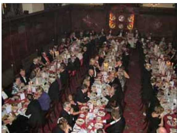
The Luncheon Club rounded-off another successful year with its traditional dinner at Cutlers’ Hall

‘Out with the Old – In with the New 2010/2011’