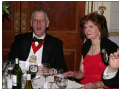
The Master looking astonished by the amount of money raised!