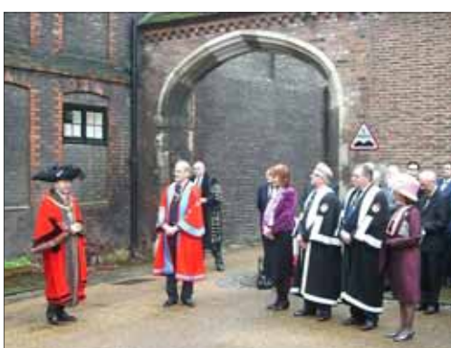
The Lord Mayor addresses the assembled company then presents a clay pipe, excavated from a City construction site, to the Paviors to commemorate the official opening