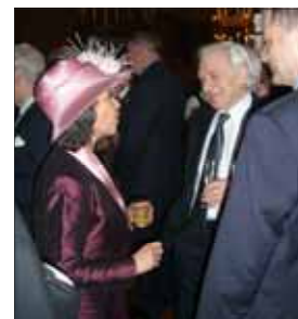
The Lord Mayor and Lady Mayoress mingle with guests