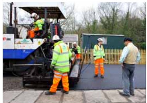
Victorian highway; modern technology