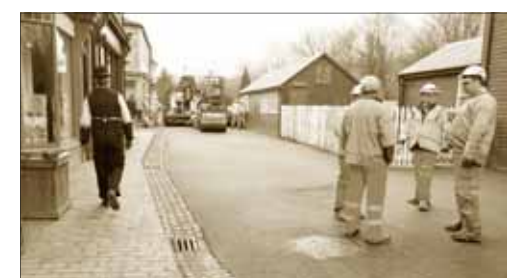
A job well done!