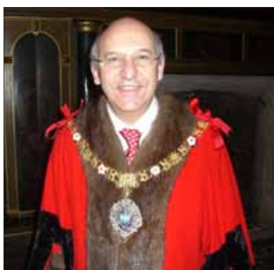
The Lord Mayor wears the chain of office originally made for Sir Thomas More, who was a pupil at Charterhouse School—the chain is reputedly insured for £10 million!