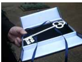
The ceremonial key used to open Paviors' House